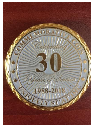
Both sides of the 30 th Anniversary Challenge Coins that were gifted during the St'at'imc Gathering where the May 10 th St'at'imc Declaration Day is celebrated over the weekend-long celebration